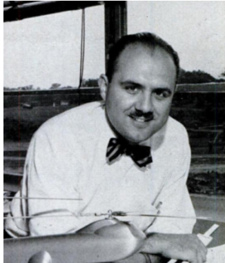
Frank N. Piasecki